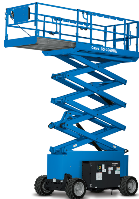
07/15 Part No. B127304UK