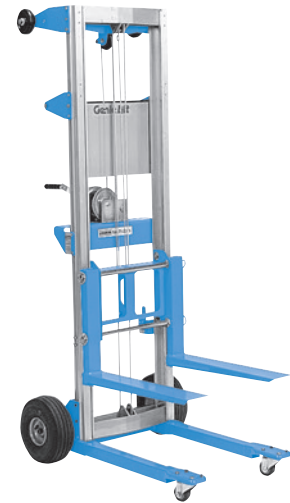
(1) Available aftermarket only