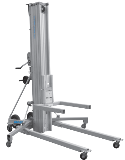
(1) Available aftermarket only