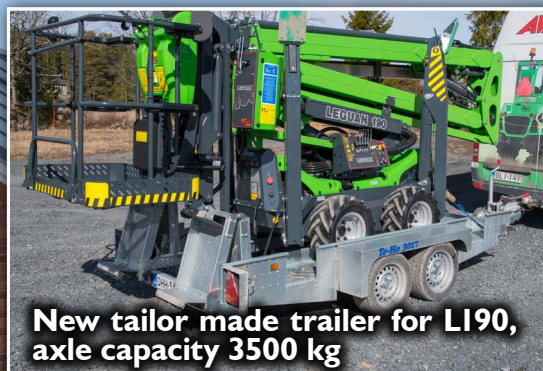
New tailor made trailer for L190, axle capacity 3500 kg