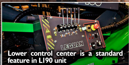
Lower control center is a standard feature in L190 unit