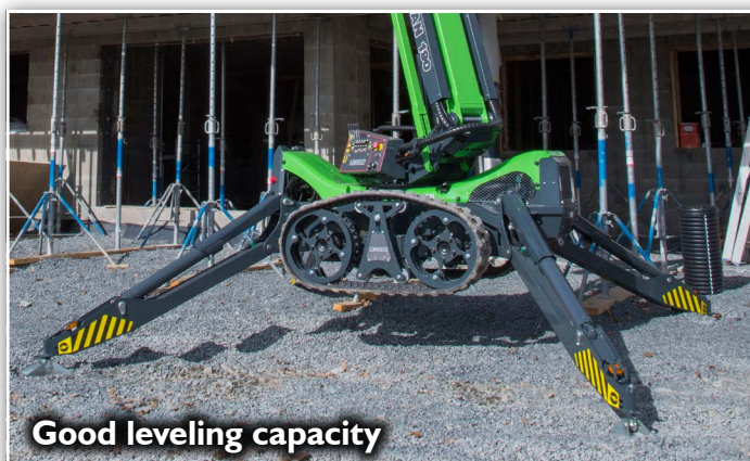
Good leveling capacity