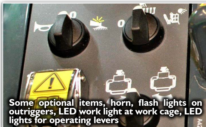
Some optional items, horn, flash lights on outriggers, LED work light at work cage, LED lights for operating levers