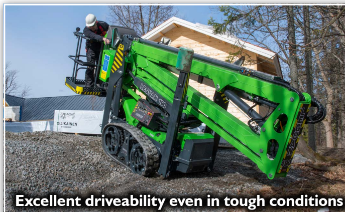
Excellent driveability even in tough conditions