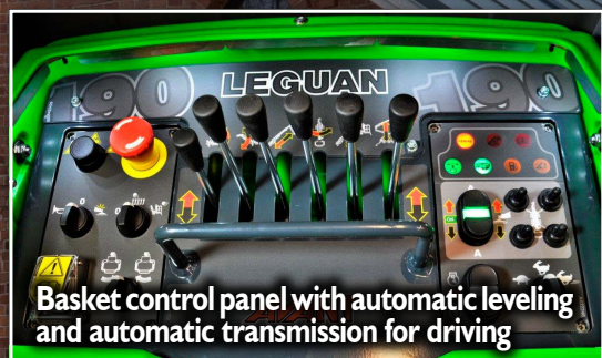
Basket control panel with automatic leveling and automatic transmission for driving